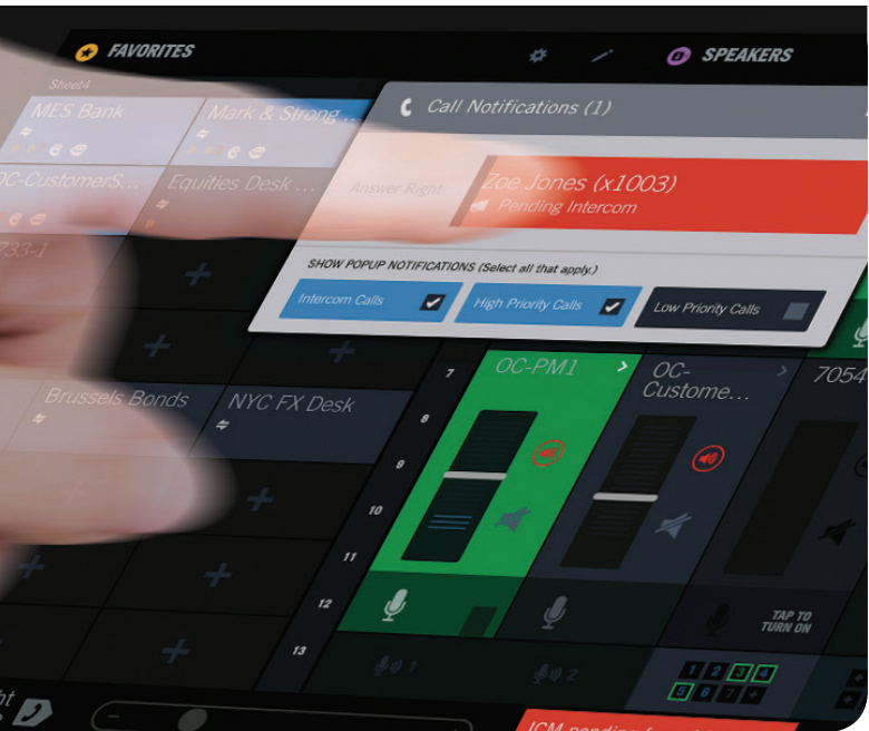
Tap or swipe to answer call on right or left handset

Go ahead – touch, tap, swipe, drag and drop – you're ready to do exactly what you want.